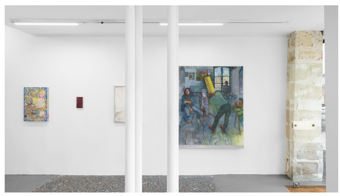
SUITE N°1, exhibition views, Galerie John Ferrère

Throughout the exhibition, a series of concerts and performances, in dialogue with the exhibited works, will be offered in the gallery's three spaces.