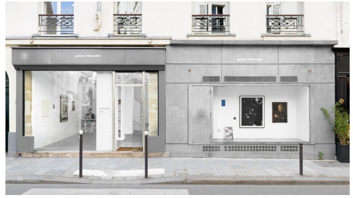
SUITE N°1, exhibition views, Galerie John Ferrère

Galerie John Ferrère is pleased to invite you to SUITE N 1, from May 12 to June 24 at 18, rue Dauphine.