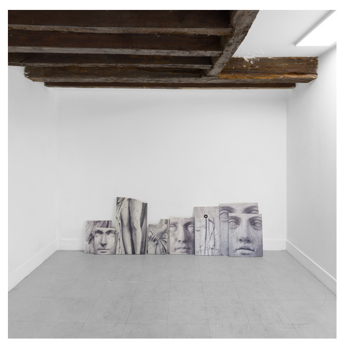
SUITE N°1, exhibition views, Galerie John Ferrère